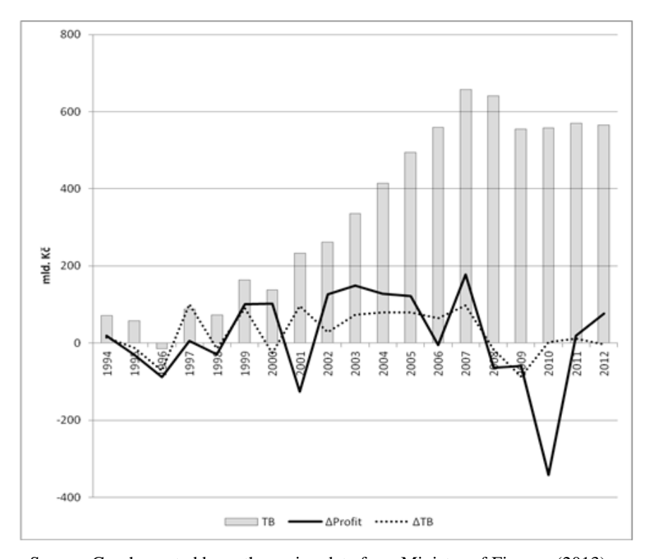
Fig. 4: Accounting profit and tax base: total and annual changes for the Czech Republic